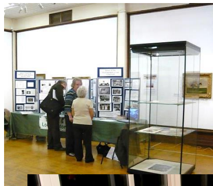
Far left: Local History Fair at Tickhill Library in 2012