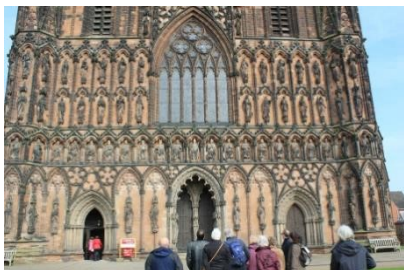
Lichfield Cathedral (left)