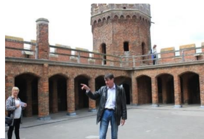
Tattershall Castle (right)